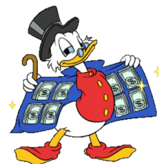
Vacant Fundraising Chair